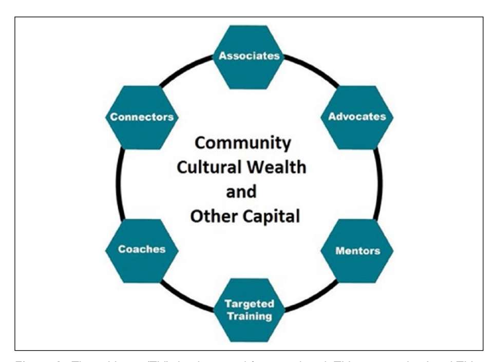
Figure 1. Thrive Mosaic (TM) developmental framework with TM partner roles. Initial TM partners often come from the collection of the scholar's networks.